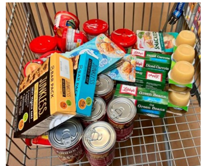
Restocking Pastor's Emergency Food Pantry