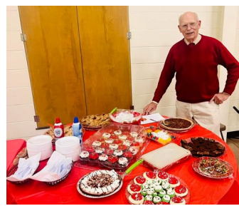
Christmas Dinner sponsored by the Men of the Church And enjoyed by all...