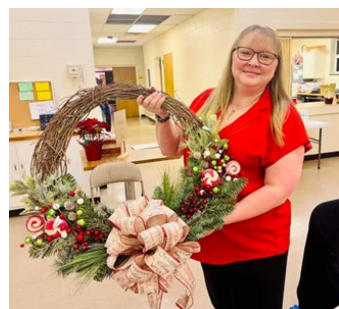
Lucky winner of the Grand Prize of the Door Prizes