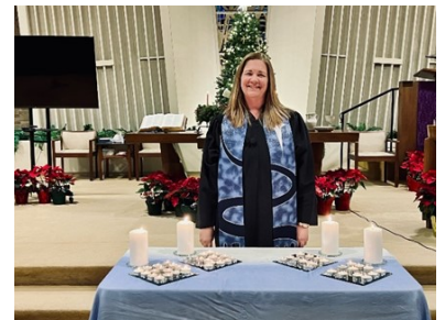
Blue Christmas Service