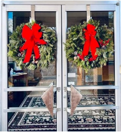
Hanging of the Green Service