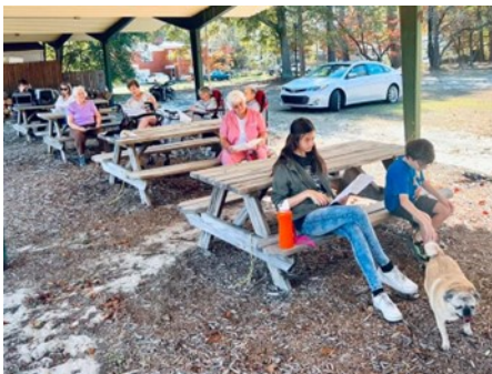
Blessing of the Pets Outdoor Service