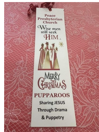
Dinner and a Show!